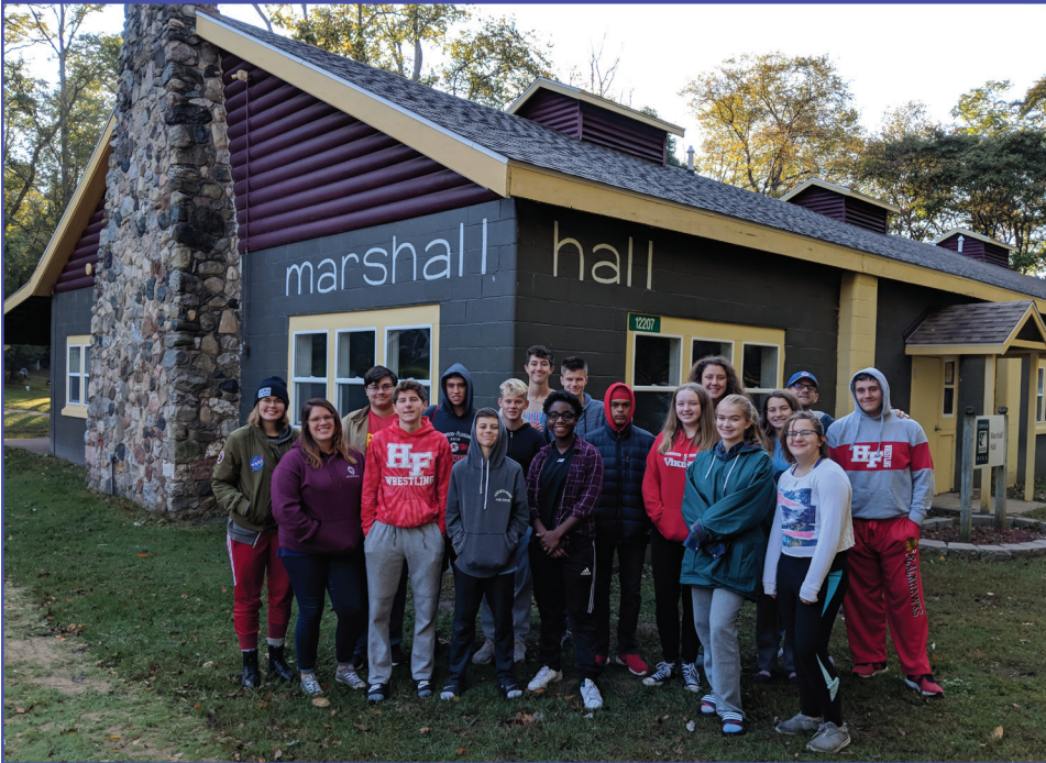
Retreats! Quest "retreated" to Tower Hill October 12-14 and learned more about themselves through Myers-Briggs & spiritual gifts (above).