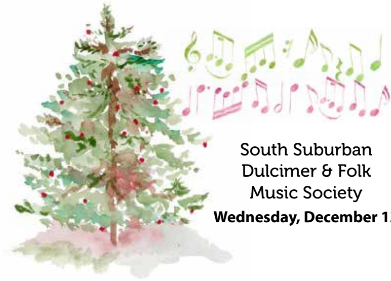
South Suburban Dulcimer & Folk Music Society Wednesday, December 13