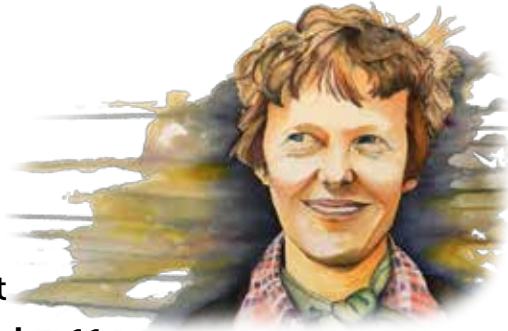
Amelia Earhart Wednesday, October 11